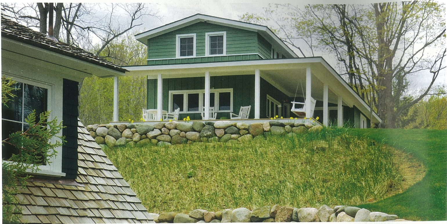
The historic and remodeled Grace cottage sits on a bluff overlooking the Virosteck home and Walloon Lake.