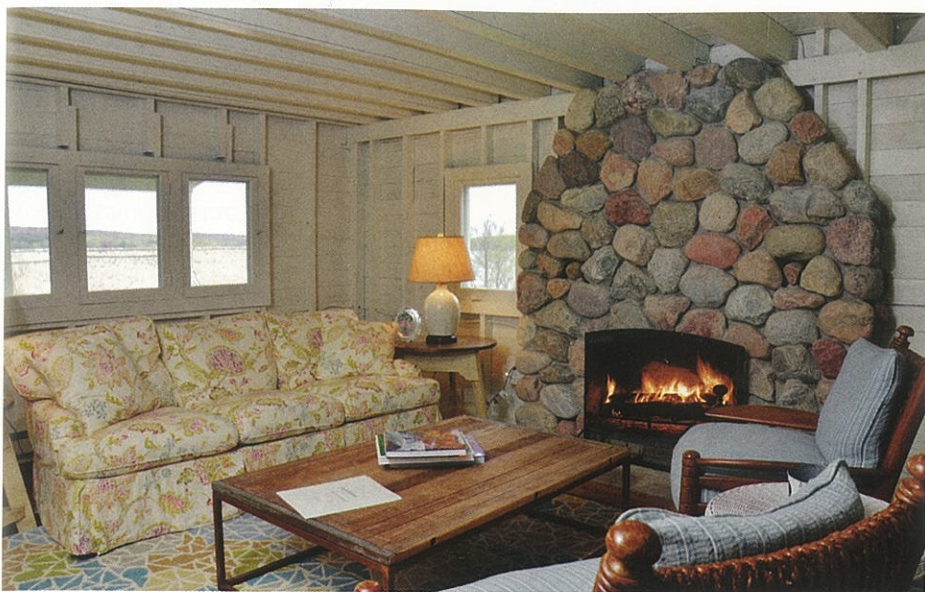
The main room of the cottage looks basically as it was, with uninsulated walls and ceiling and a large fieldstone fireplace.